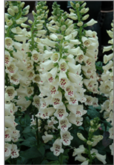
Camelot Cream Foxglove flowers