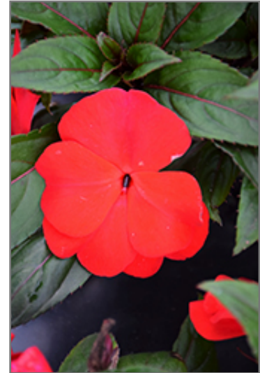
Divine Scarlet Bronze Leaf New Guinea Impatiens flowers

Divine Scarlet Bronze Leaf New Guinea Impatiens is recommended for the following landscape applications;