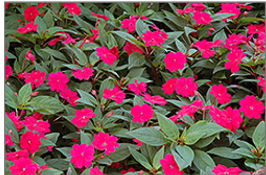
Bounce Cherry Impatiens in bloom