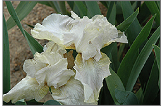
Renown Iris flowers