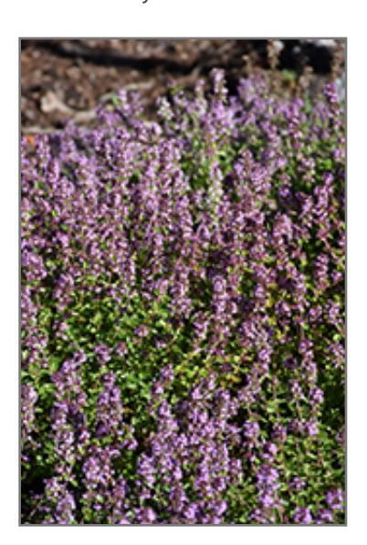
Lemon Thyme flowers