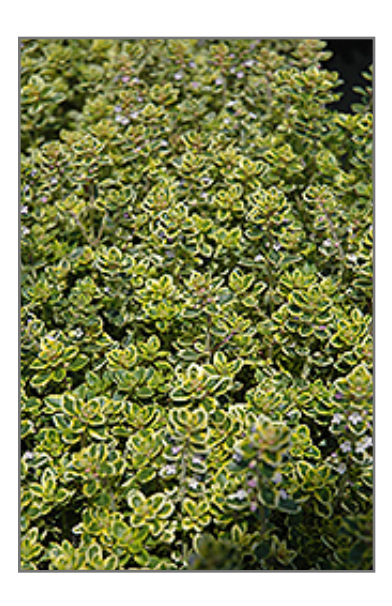
Lemon Thyme foliage

Lemon Thyme is smothered in stunning spikes of lilac purple flowers rising above the foliage from early to late summer. Its attractive tiny fragrant round leaves remain light green in color throughout the year.