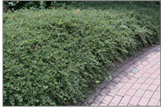
Coral Beauty Cotoneaster