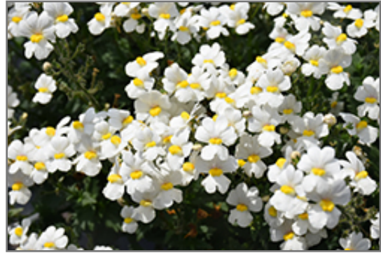
Sunsatia Coconut Nemesia flowers