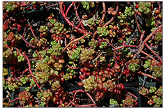
Spreading Stonecrop foliage

Spreading Stonecrop is recommended for the following landscape applications;