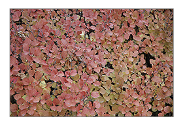
Dwarf Korean Lilac in fall

This shrub should only be grown in full sunlight. It is very adaptable to both dry and moist locations, and should do just fine under average home landscape conditions. It is not particular as to soil type or pH. It is highly tolerant of urban pollution and will even thrive in inner city environments. This is a selected variety of a species not originally from North America.