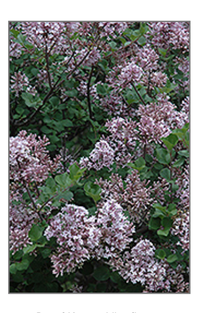
Dwarf Korean Lilac flowers

Dwarf Korean Lilac is recommended for the following landscape applications;