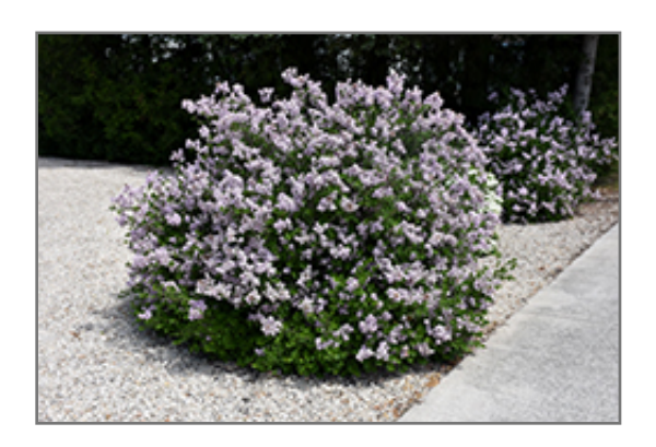
Dwarf Korean Lilac in bloom