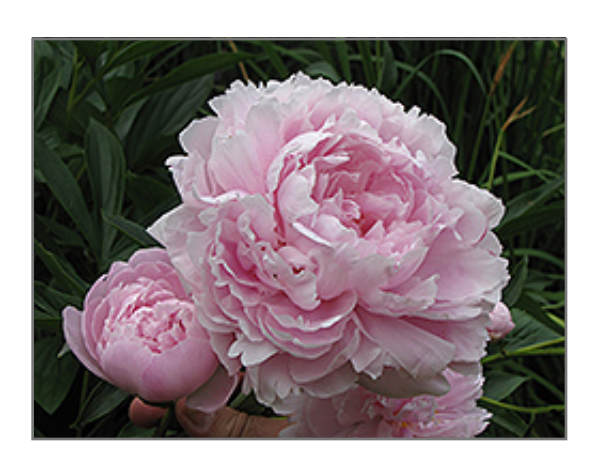
Double Pink Peony flowers

This luxurious peony will create a dramatic late spring display in garden and border plantings; the buds open to reveal stunning, soft pink blooms with slight hints of lavender; the fragrant flowers open on stiff stems making them an excellent cut flower