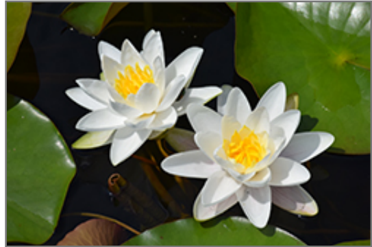
Gladstoniana Hardy Water Lily flowers