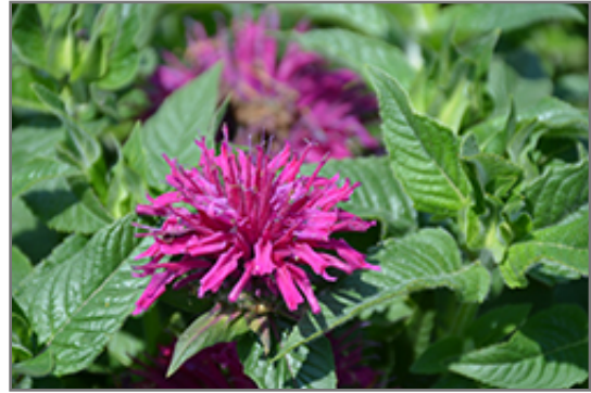
Pardon My Purple Beebalm flowers

Pardon My Purple Beebalm is recommended for the following landscape applications;