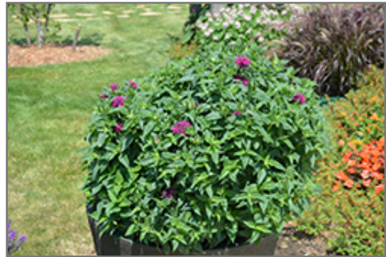
Pardon My Purple Beebalm in bloom