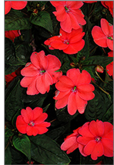
SunPatens Compact Coral New Guinea Impatiens flowers

SunPatens Compact Coral New Guinea Impatiens is recommended for the following landscape applications;