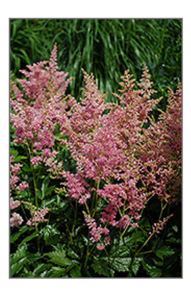
Amethyst Astilbe flowers

Lovely lilac-mauve colored plumes rising above lacy delicate leaves; perfect in a shady spot with dappled light; prefers moisture so water regularly for abundant flowers and nice foliage