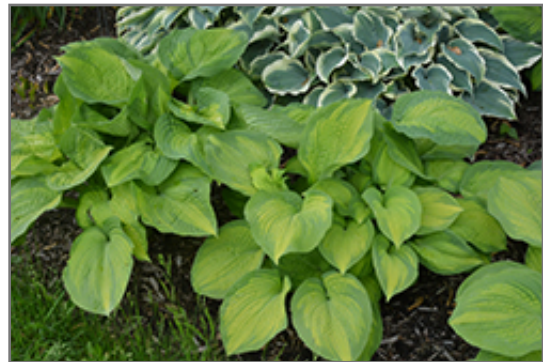
Brother Stefan Hosta