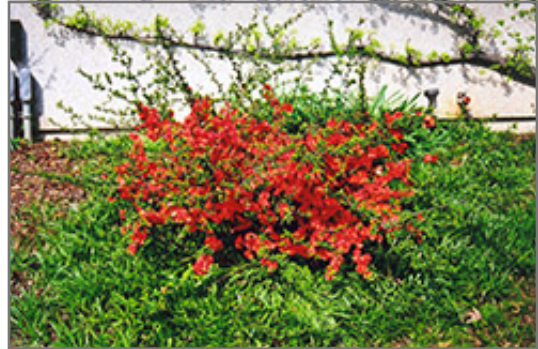
Common Flowering Quince in bloom

This is a high maintenance shrub that will require regular care and upkeep, and should only be pruned after flowering to avoid removing any of the current season's flowers. Gardeners should be aware of the following characteristic(s) that may warrant special consideration;