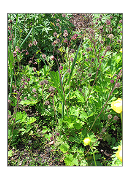
Water Avens in bloom

An underused gem that flowers for a long period; pink blooms nod above bright green foliage for a truly elegant effect; likes moisture and is great for pond borders as well as garden applications