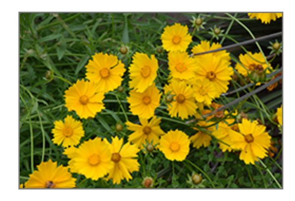
Lanceleaf Tickseed flowers

All this variety needs is well drained soil and lots of sunshine and it will bloom profusely all summer long; a more open and airy form and a wildflower look that blends well in a cottage style garden; when positioning remember flowers follow the sun