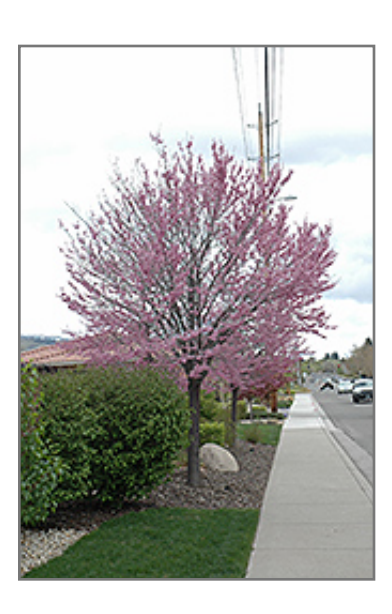
Eastern Redbud in bloom