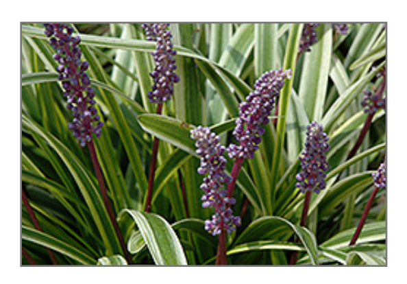
Variegata Lily Turf flowers

Variegata Lily Turf is recommended for the following landscape applications;