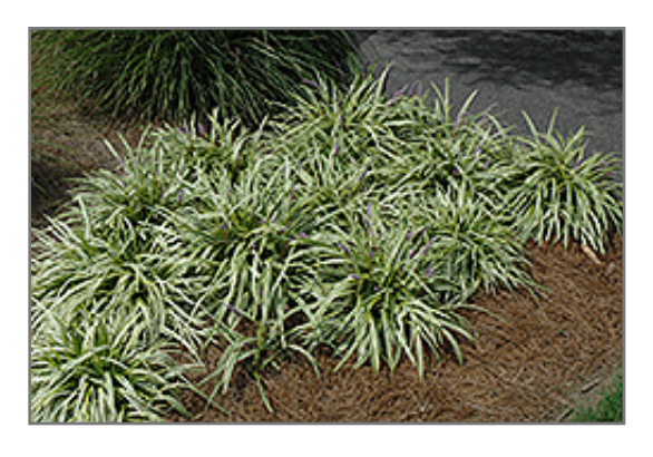
Variegata Lily Turf in bloom