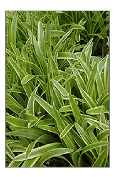
Variegata Lily Turf foliage

This plant does best in partial shade to shade. It does best in average to evenly moist conditions, but will not tolerate standing water. It is not particular as to soil type or pH. It is somewhat tolerant of urban pollution. This is a selected variety of a species not originally from North America. It can be propagated by division; however, as a cultivated variety, be aware that it may be subject to certain restrictions or prohibitions on propagation.