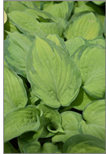
Paradigm Hosta foliage

Paradigm Hosta will grow to be about 10 inches tall at maturity extending to 18 inches tall with the flowers, with a spread of 4 feet. When grown in masses or used as a bedding plant, individual plants should be spaced approximately 4 feet apart. Its foliage tends to remain low and dense right to the ground. It grows at a medium rate, and under ideal conditions can be expected to live for approximately 10 years. As an herbaceous perennial, this plant will usually die back to the crown each winter, and will regrow from the base each spring. Be careful not to disturb the crown in late winter when it may not be readily seen!