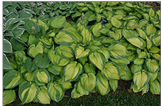
Paradigm Hosta