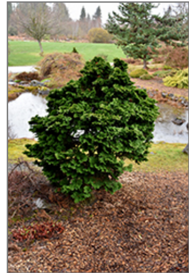
Dwarf Hinoki Falsecypress