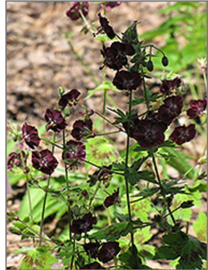
Samobor Cranesbill in bloom

Samobor Cranesbill is recommended for the following landscape applications;