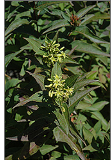
Butterfly Southern Bush Honeysuckle flowers

Butterfly Southern Bush Honeysuckle is recommended for the following landscape applications;