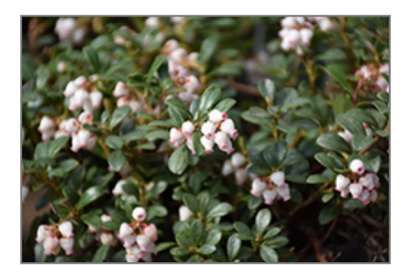
Massachusetts Bearberry flowers

Massachusetts Bearberry will grow to be about 12 inches tall at maturity, with a spread of 4 feet. It tends to fill out right to the ground and therefore doesn't necessarily require facer plants in front. It grows at a slow rate, and under ideal conditions can be expected to live for approximately 20 years.