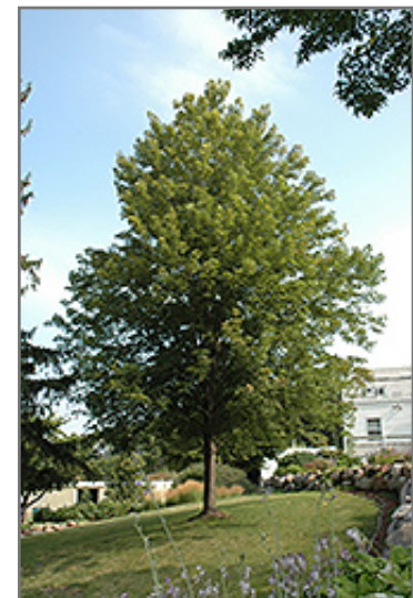
Celebration Maple