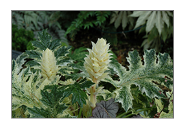
Whitewater Acanthus foliage

Large, jagged leaves splashed with spectacular white mottling fade to cream with age; beautiful spikes of pink/white flowers tower over the foliage; longer leaves are more deeply cut than the species; a vigorous grower