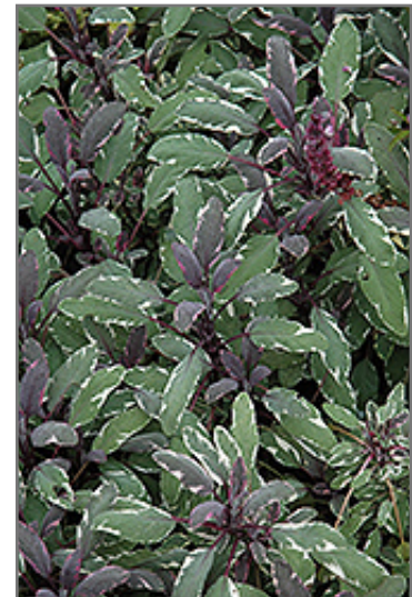
Tricolor Sage foliage