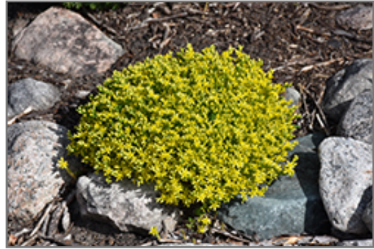
Golden Moss Stonecrop in bloom

Golden Moss Stonecrop is recommended for the following landscape applications;