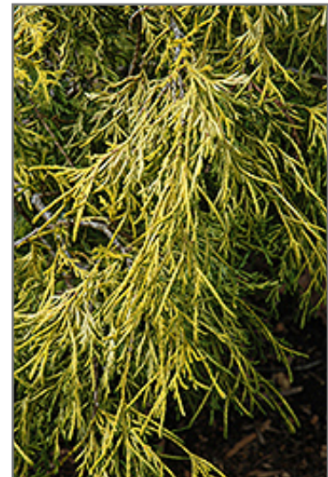
Lemon Thread Falsecypress foliage