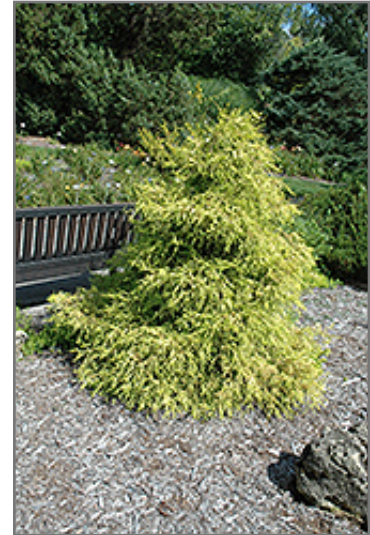
Lemon Thread Falsecypress

Lemon Thread Falsecypress is recommended for the following landscape applications;