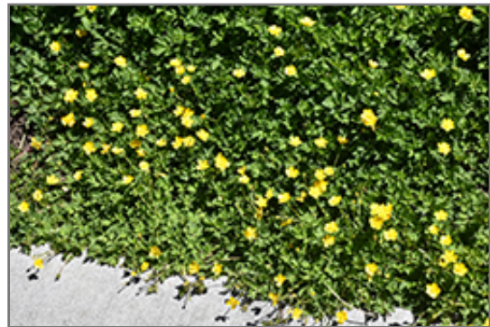
Barren Strawberry in bloom