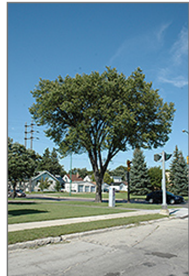
American Elm