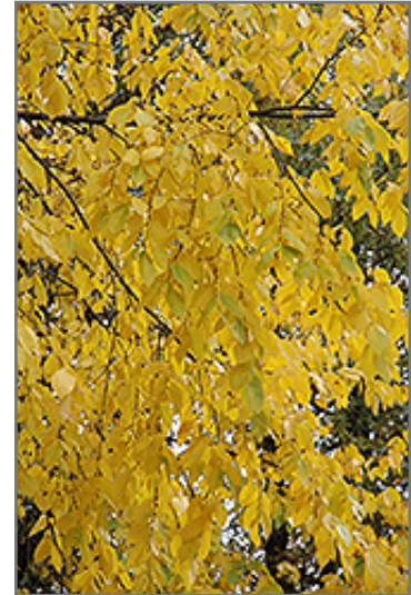
American Elm in fall

This tree should only be grown in full sunlight. It is an amazingly adaptable plant, tolerating both dry conditions and even some standing water. It is not particular as to soil type or pH, and is able to handle environmental salt. It is highly tolerant of urban pollution and will even thrive in inner city environments. This species is native to parts of North America.