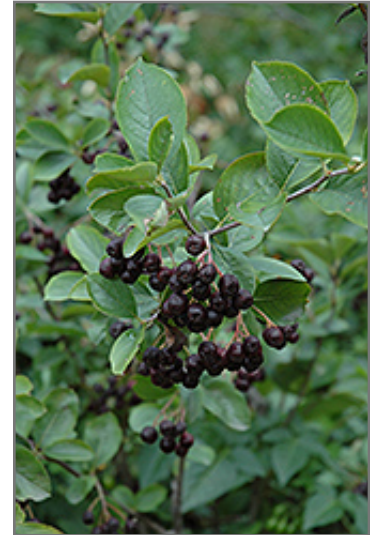
Black Chokeberry fruit