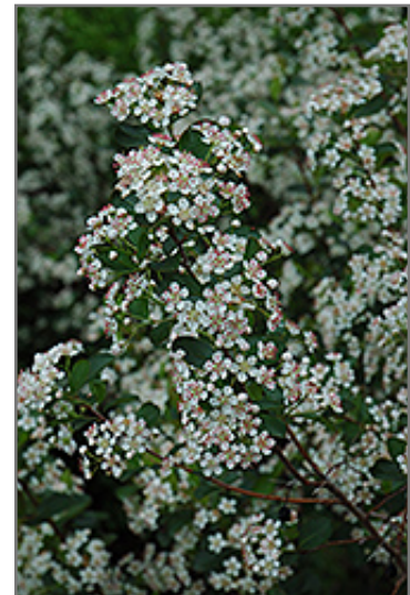
Black Chokeberry flowers