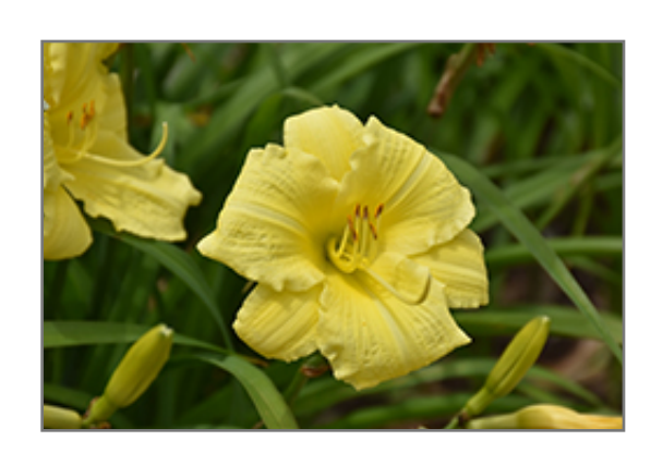
Rainbow Rhythm Going Bananas Daylily flowers

Reblooming, bright, yellow trumpets with green throat; sturdy, strong, easy to care for, great grassy texture and form; good for the beginner gardener and the pro