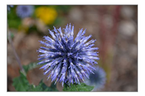
Blue Glow Globe Thistle flowers

Blue Glow Globe Thistle will grow to be about 3 feet tall at maturity extending to 4 feet tall with the flowers, with a spread of 24 inches. The flower stalks can be weak and so it may require staking in exposed sites or excessively rich soils. It grows at a fast rate, and under ideal conditions can be expected to live for approximately 10 years. As an herbaceous perennial, this plant will usually die back to the crown each winter, and will regrow from the base each spring. Be careful not to disturb the crown in late winter when it may not be readily seen!