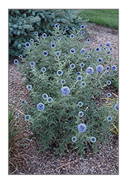
Blue Glow Globe Thistle in bloom