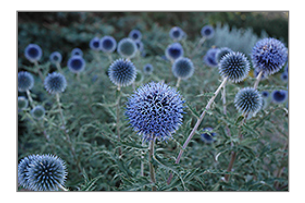
Blue Glow Globe Thistle flowers

Blue Glow Globe Thistle is recommended for the following landscape applications;