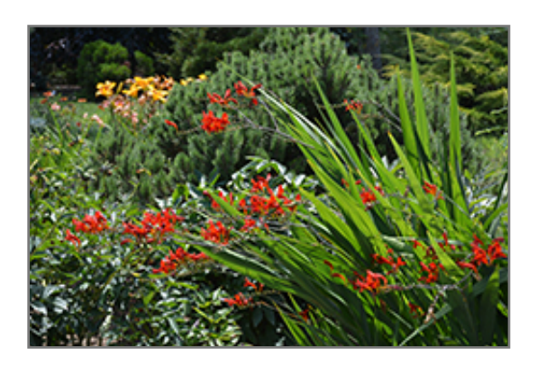
Lucifer Crocosmia in bloom

This is a relatively low maintenance plant, and should be cut back in late fall in preparation for winter. It is a good choice for attracting bees, butterflies and hummingbirds to your yard, but is not particularly attractive to deer who tend to leave it alone in favor of tastier treats. It has no significant negative characteristics.