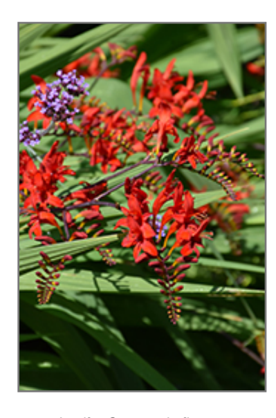
Lucifer Crocosmia flowers

Lucifer Crocosmia is an herbaceous perennial with an upright spreading habit of growth. Its medium texture blends into the garden, but can always be balanced by a couple of finer or coarser plants for an effective composition.