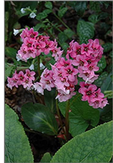
Pink Dragonfly Bergenia flowers