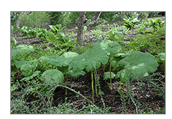
Astilboides foliage

Dramatic large dinner plate-sized foliage has ruffled edges and prominent veins; subtle astilbe-like spikes of flowers; coarse leaves complements finer foliaged plants in the landscape; happiest in mostly shade with lots of moisture