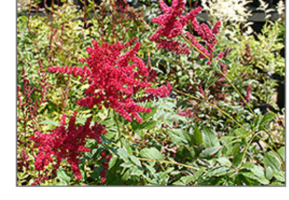
Glow Astilbe flowers