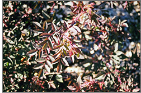
Red Leaf Rose foliage

This shrub should only be grown in full sunlight. It does best in average to evenly moist conditions, but will not tolerate standing water. It is not particular as to soil type or pH. It is highly tolerant of urban pollution and will even thrive in inner city environments. This species is not originally from North America.