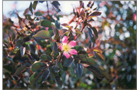
Red Leaf Rose flowers

This is a high maintenance shrub that will require regular care and upkeep, and is best pruned in late winter once the threat of extreme cold has passed. It is a good choice for attracting bees to your yard. Gardeners should be aware of the following characteristic(s) that may warrant special consideration;