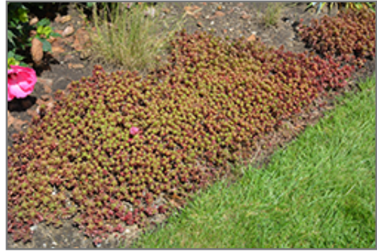
Fulda Glow Stonecrop