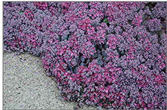
Lidakense Stonecrop in bloom