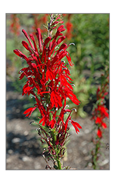
Cardinal Flower flowers