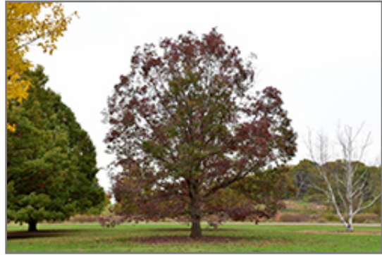
White Oak in fall

White Oak will grow to be about 90 feet tall at maturity, with a spread of 70 feet. It has a high canopy of foliage that sits well above the ground, and should not be planted underneath power lines. As it matures, the lower branches of this tree can be strategically removed to create a high enough canopy to support unobstructed human traffic underneath. It grows at a slow rate, and under ideal conditions can be expected to live to a ripe old age of 300 years or more; think of this as a heritage tree for future generations!