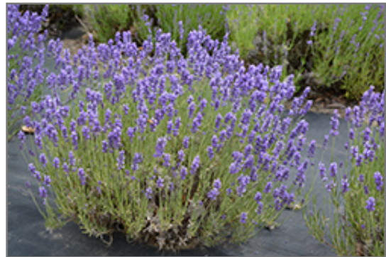
Hidcote Lavender in bloom