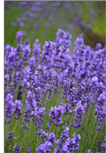
Hidcote Lavender flowers