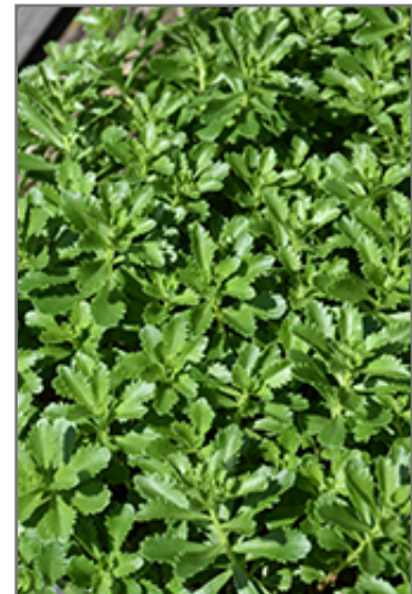
Japanese Stonecrop