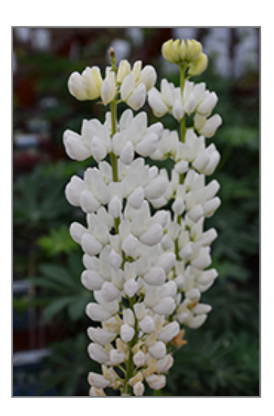
Noble Maiden Lupine flowers

A captivating variety producing showy, erect spikes of eye catching ivory white flowers with hints of cream; a tremendous visual impact massed in the garden, border plantings or in containers