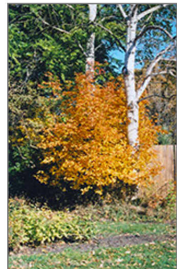
Saskatoon in fall