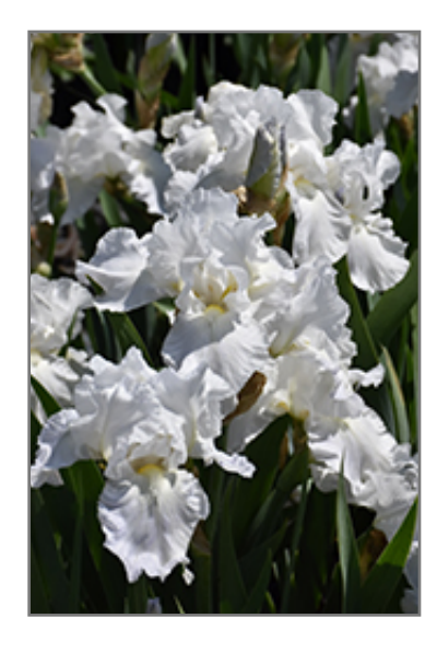
Immortality Iris flowers

Immortality Iris features bold white flag-like flowers with a buttery yellow beard at the ends of the stems in mid spring. The flowers are excellent for cutting. Its sword-like leaves remain green in color throughout the season.