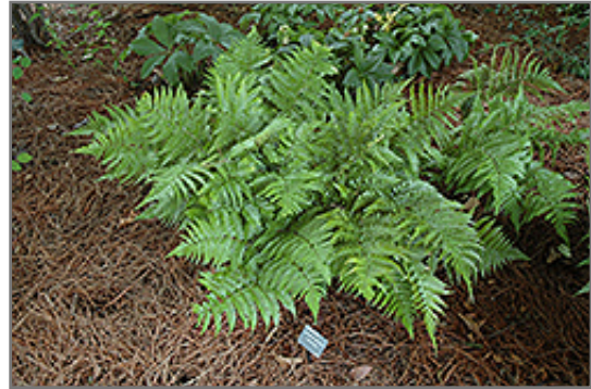
Autumn Fern

Autumn Fern will grow to be about 18 inches tall at maturity, with a spread of 18 inches. Its foliage tends to remain dense right to the ground, not requiring facer plants in front. It grows at a medium rate, and under ideal conditions can be expected to live for approximately 15 years. As an evergreen perennial, this plant will typically keep its form and foliage year-round.