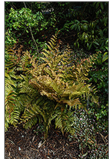
Autumn Fern